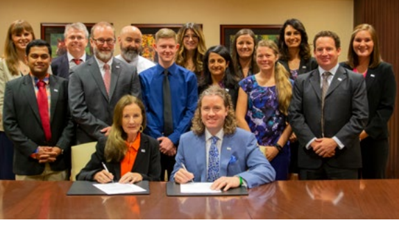
Alltech committed to the United Nations Global Compact (UNGC) on July 12, 2019.